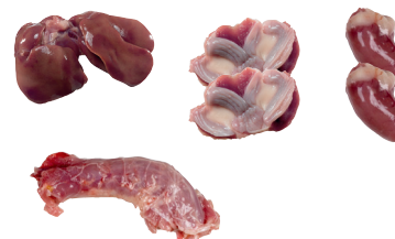
Giblets after harvesting