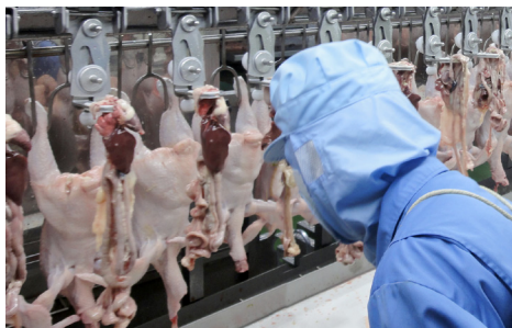
Transfer of giblet pack to further processing

The Eviscerator model 218 delivers the right quality to the sub-processes by removing the giblet pack in an efficient and safe way without compromising the quality of the chicken. The Eviscerator model 218 offers the following features at a glance: